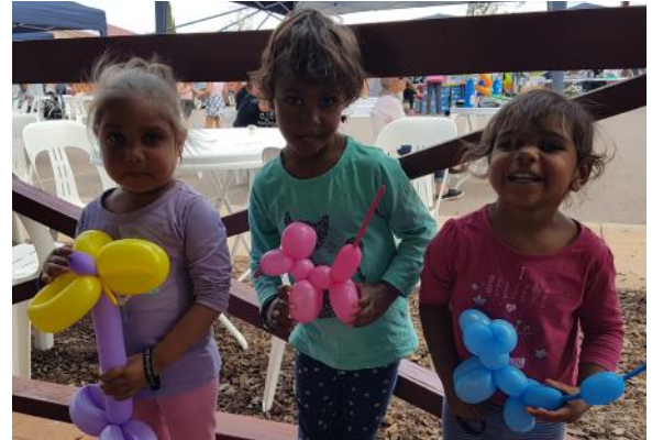
Above: Local kids with their balloon creations