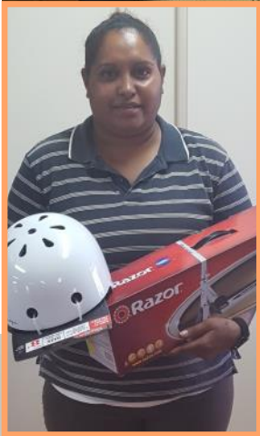
Scooter and bike winners