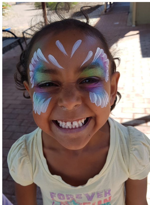
Local children enjoyed the roaming Clown's balloon creations (above) and having their face painted (right)