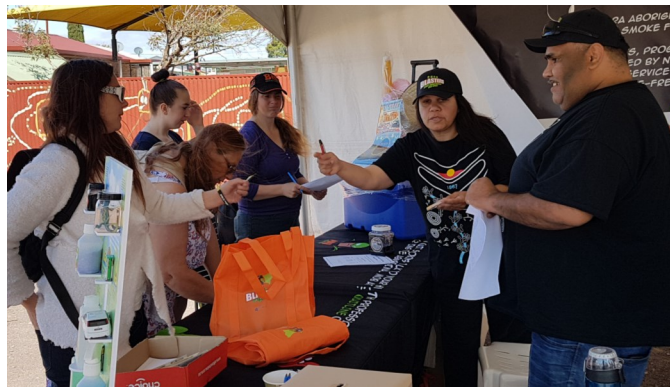
Community members pictured at the Tackling Smoking Stall