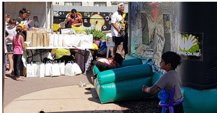
The Environmental Health bouncy castle & giveaways were popular