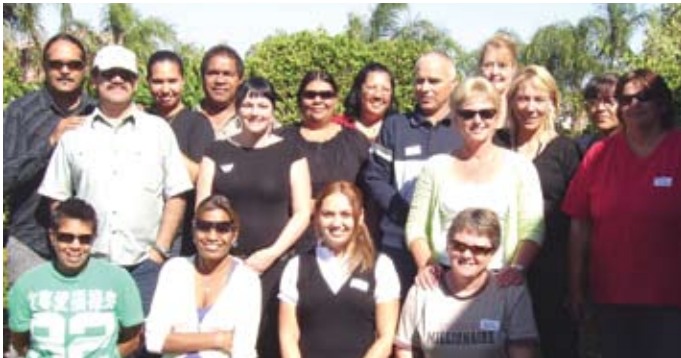
Staff and Board Members at the annual strategic planning day