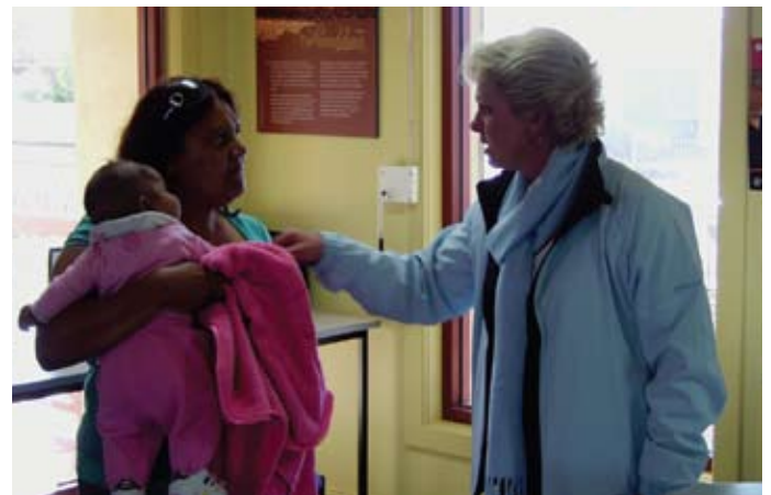
Swine Flu information session

The risks of catching 'swine flu' can be minimised by having the seasonal flu vaccination; limiting exposure to people who have the flu; and if you have the flu, limiting your exposure to family and friends.