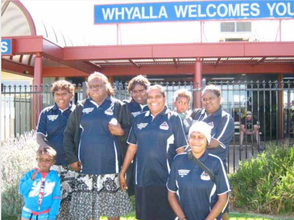
Visitors from Yuendumu